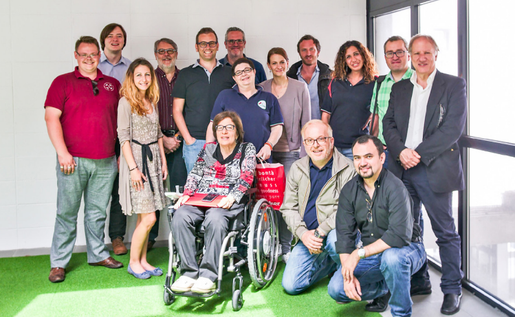
The project group at their first workshop