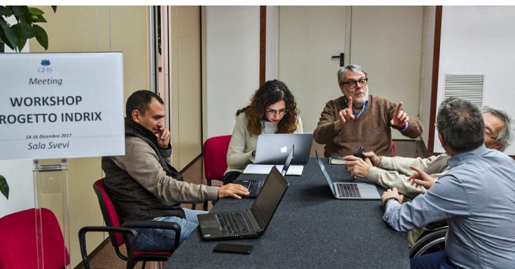
Participants at a project workshop

The project INDRIX is developing a social resilience index with a particular focus on inclusion of vulnerable groups of people. To achieve this, the project brings together stakeholders from social services, civil protection, and representatives of the target groups.